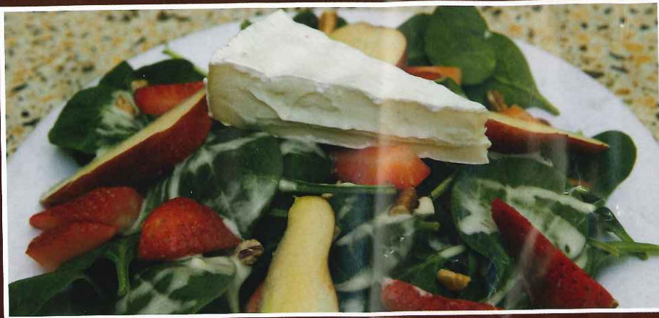
Strawberry & Brie Salad